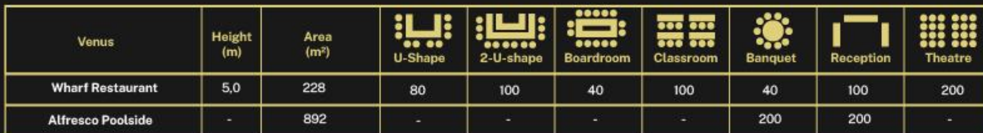
Table 2. Venues and Meeting Room Types at Seaside Boutique Resort Quy Nhon.